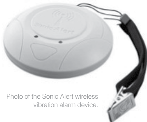
Photo of the Sonic Alert wireless vibration alarm device.

Access staff can help identify telecommunications devices that are right for you, and help you apply for the Telecommunications Equipment Purchase Program (TEPP).