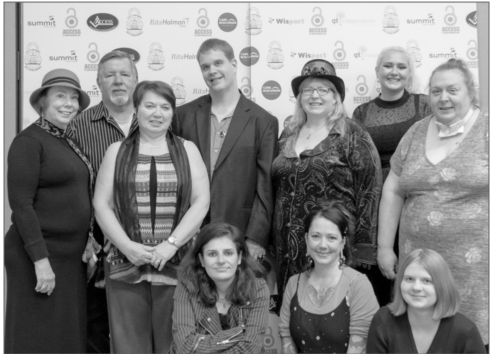
Some of the artists who submitted their work to the event pose for the camera.

If you weren't able to attend this year's event, we sincerely look forward to seeing you next year!